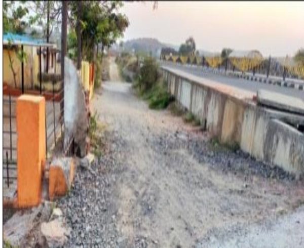
Image: Poorly constructed service roads