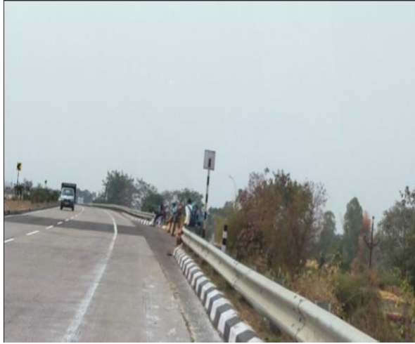
Image: Due to lack of waiting area, students have to wait on the highway(NH-69)